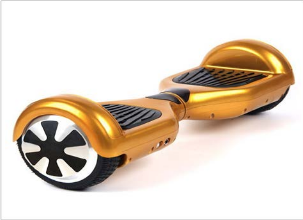
Picture of Hoverboard

Hazardous Materials Information Center (HMIC) toll-free at 1-800-467-4972 or at 202-366-4488. For information specific to air transportation of portable recreational vehicles powered by lithium ion batteries, visit: http://www.faa.gov/go/packsafe/ .